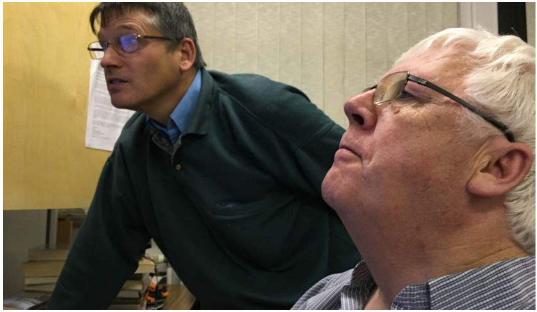
..."I told you the monitor was at the wrong angle"